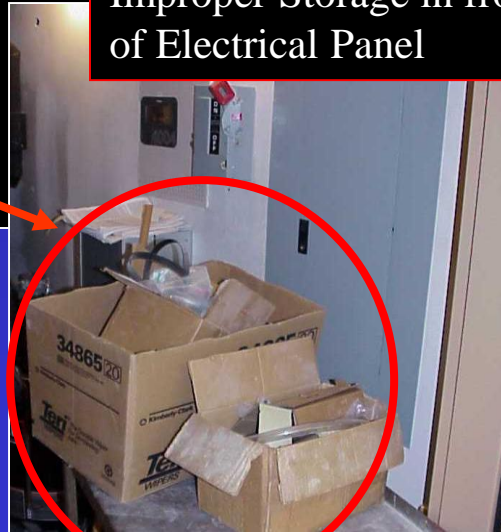
Improper Storage in front of Electrical Panel